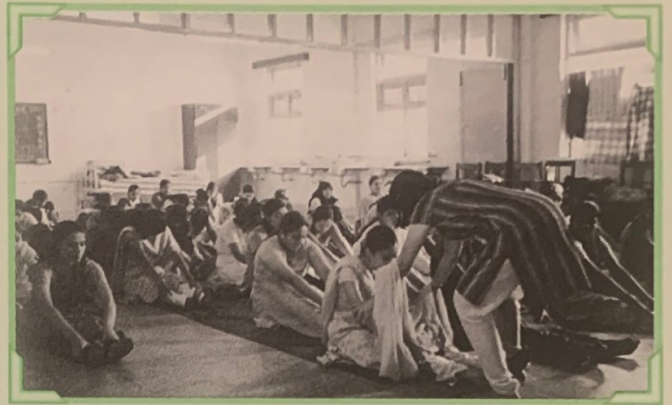
Snigdha conducted a Yoga Camp for NSS Students for 3 days