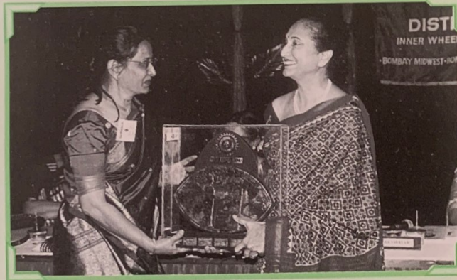
Aruna Worah Trophy for the Best President-Secretary Trophy