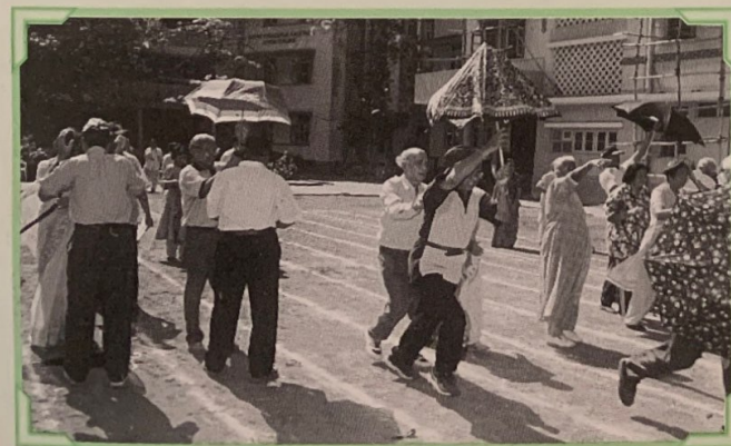
Senior Citizens Sports was a Zonal Project of Zone II