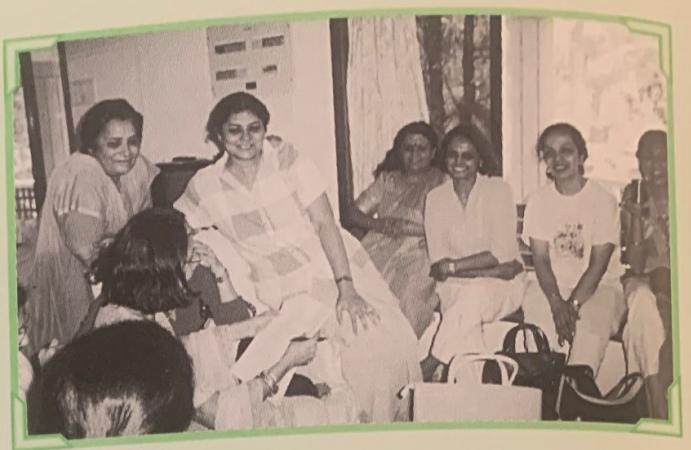
Overnight Picnic at Panvel