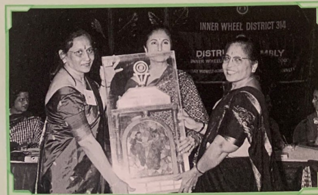
IWC of B'bay Seacoast Sr.Citizen Fellowship Trophy. We organised Sr.Citizen Sports/Ras Garba/Entertainment Prog./Medical Check-up and a Newspaper Stand for the Senior Citizens