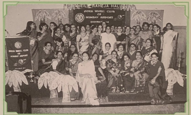
Members in an array of Kanjeevarams to celebrate Festivals of Tamil Nadu