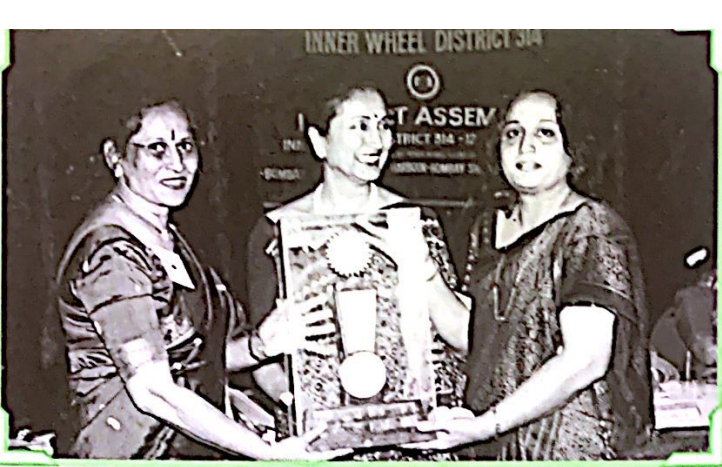
Kishore Zaveri Trophy (Rotating Trophy) for Vaccination. 50000 children have been vaccinated for Hepatitis B, Polio, Typhoid, etc.