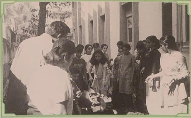
Demonstration of Vermiculture for NSS Students