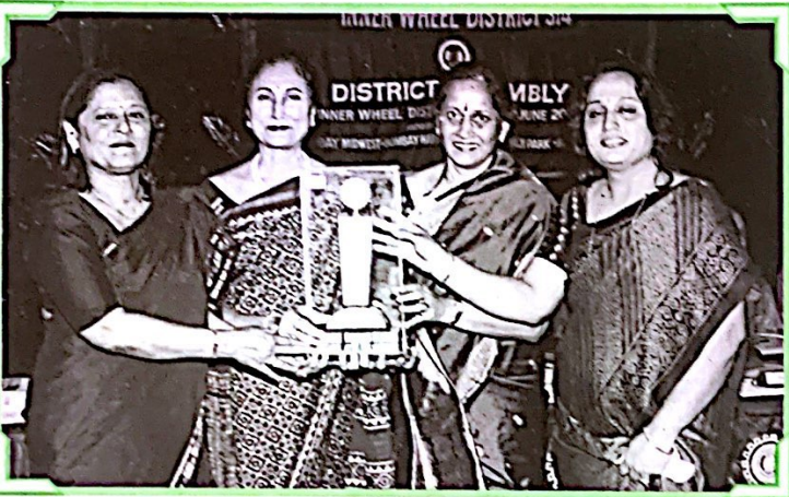
Shirin Rangwala Trophy for Child Welfare upto 15 years of age