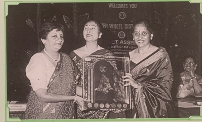
Captain S. K. Gupta Trophy for the maximum work done in Female Education