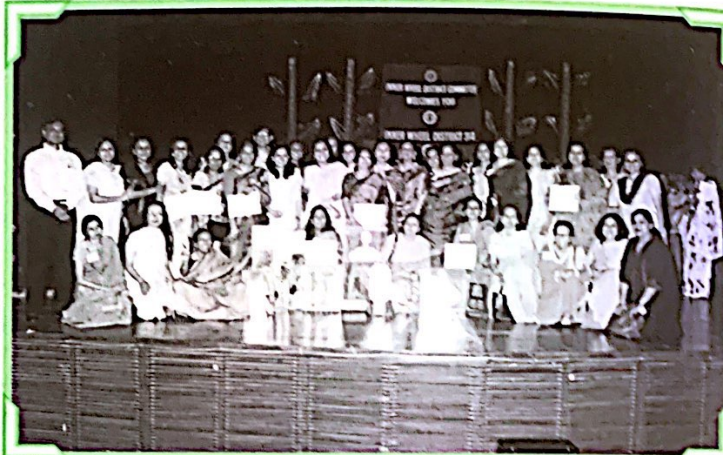
Proud members display their laurels