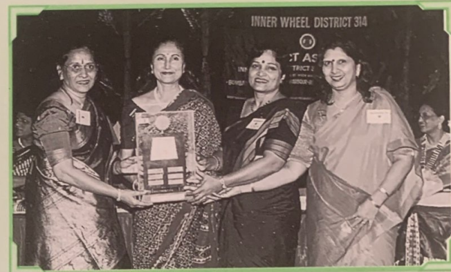
Kishore Zaveri Trophy for All Round Performance of a Club, good teamwork, good projects & active member participation