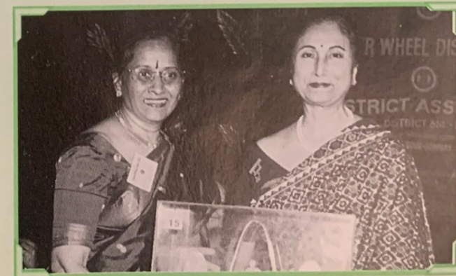
Jayaben Himmatlal Khira Trophy for Rural Work. We had a multi-project day at Maswan besides 3 Drinking Water projects