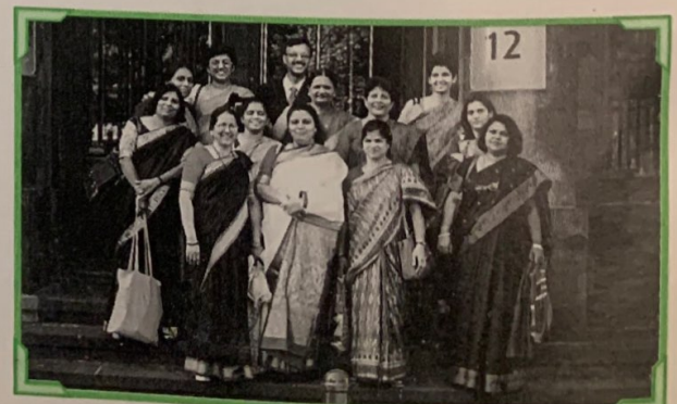
A group of qualified trainers at the Institute of Social Sciences, The Hague

Hectic Training also had a few relaxing moments at Tulip Gardens