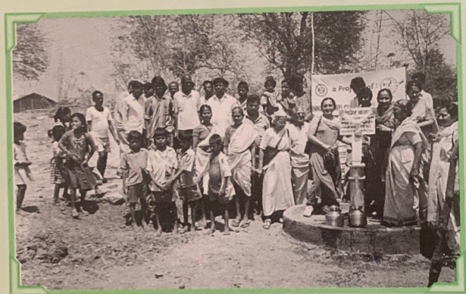
Happy villagers gather at Inauguration of Drinking Water at Maswan