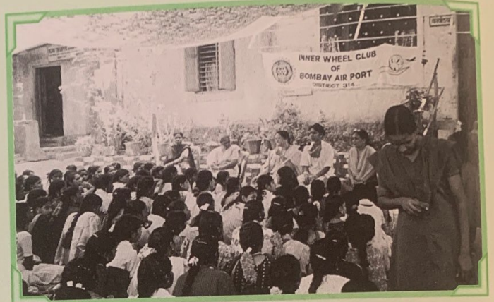
200 Adivasi Girls educated on World Health Day on women related facts