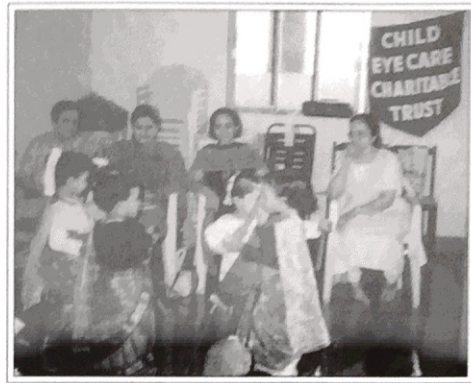
Fancy Dress Competition And Navratri Celebration With Children At Balwadi.