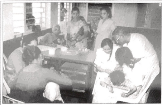
MMR Vaccination Camp At Sane Guruji School.