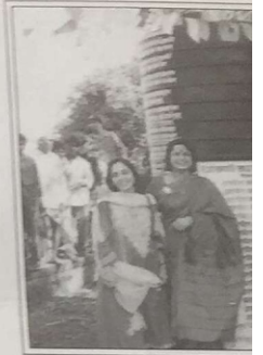
Project Inauguration By Assoc. President District Chairman