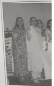
Celebration Time And