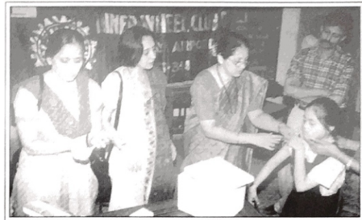
Hepatitis B Vaccination Camp At Kalyandeeep School.