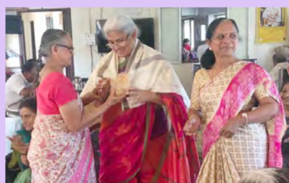
DC's Felicitation at Anand Vridhaashram