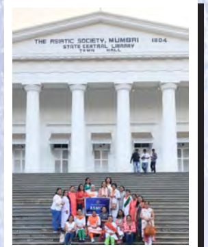
Heritage Walk and CC Fellowship