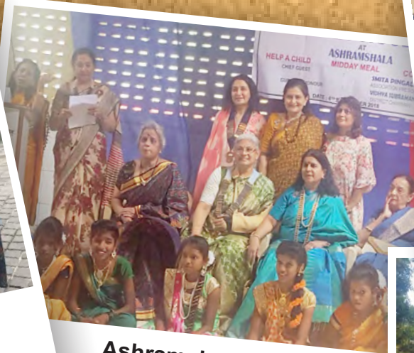
Ashramshala @ Wakdi