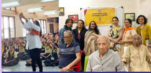
Brain Gym for Children & Senior Citizens