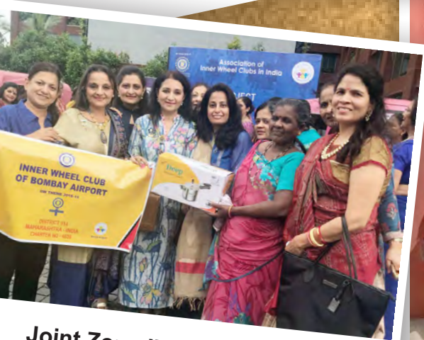
Joint Zone II Senior Citizen Project with Surat Club