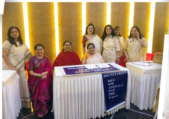
Stalwarts on duty at District Rally