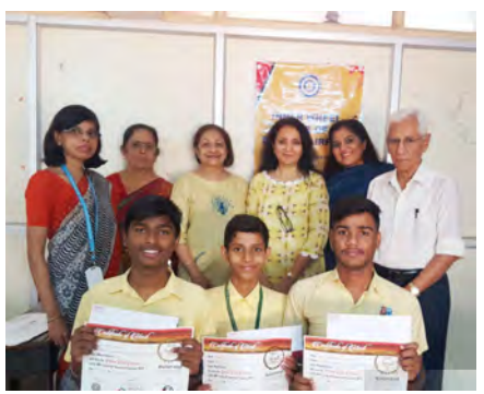
Balanand Drawing Competition Winners