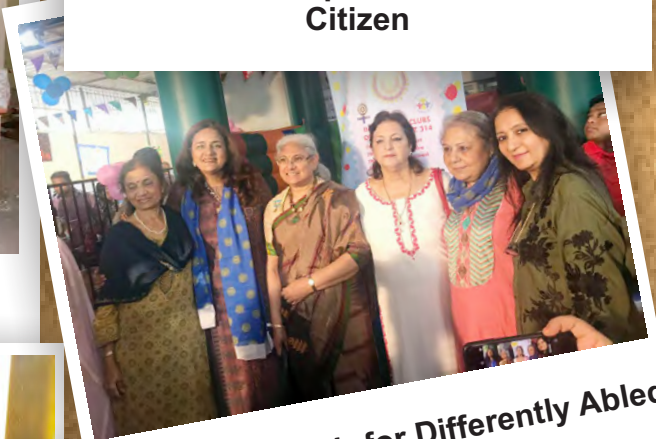
Zone II Fun Fair for Differently Abled