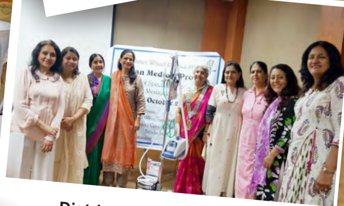
District Urban Medical Project at TATA Memorial Hospital