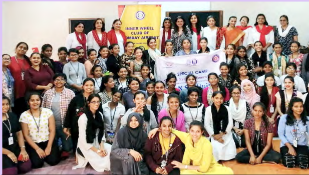
Better lives, Better Future