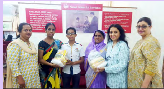
Cancer Aid Association