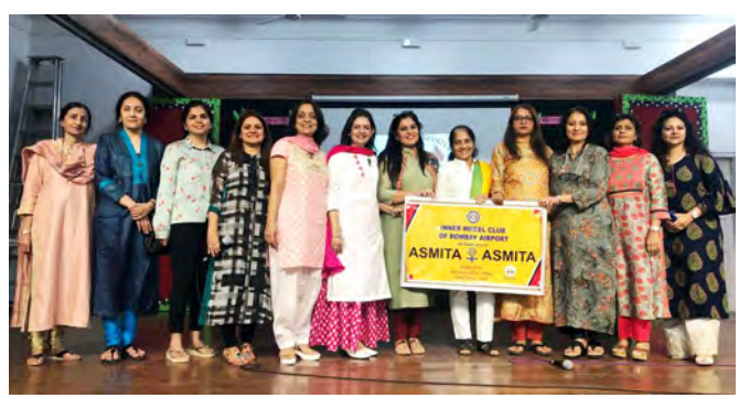
Asmita Sessions held at Nanavati & Sane Guruji School