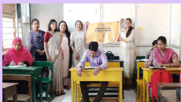
Adult Literacy - Diksha