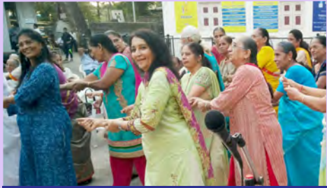
Making Senior Citizen Happy