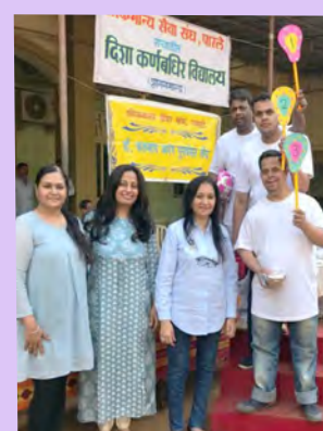
Differently abled Sports day