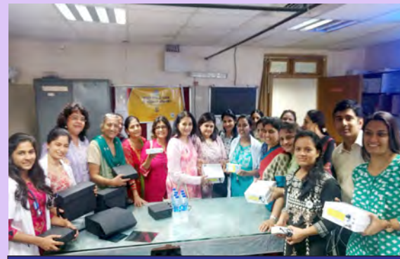
Foetal Dopler Machine Cooper Hospital