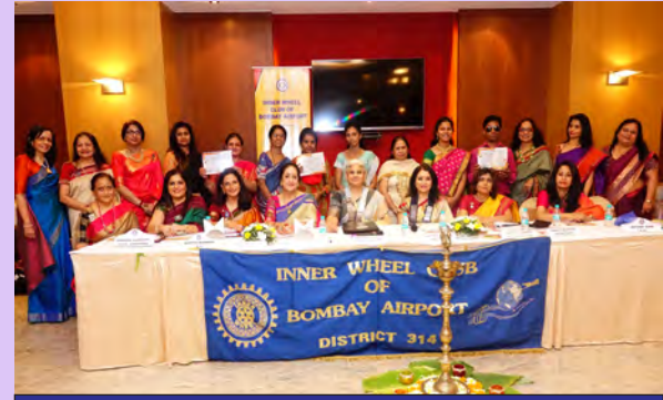
Nation Builder Awards