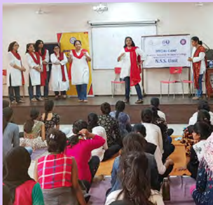
Sparsh Ek Ehsaas