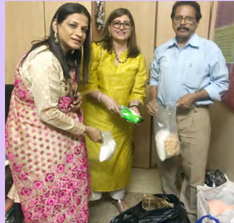
Ek Mutthi Anaj