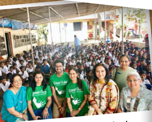
Green Souls Shoe Project