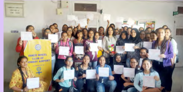
Woman Empowerment - Tally