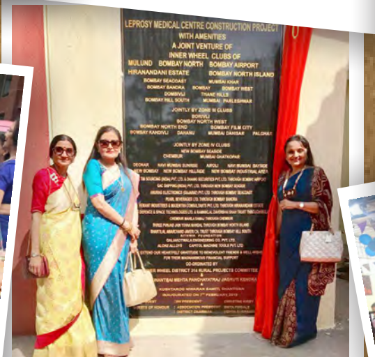
New Leprosy center at Wakdi