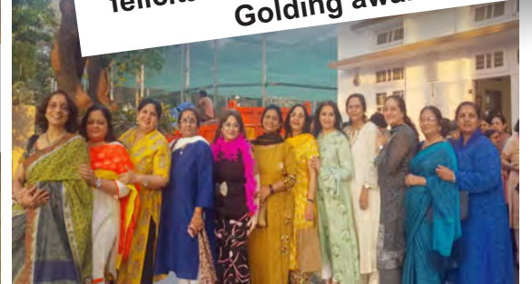
Zone II Ramp Walk of Senior Citizen