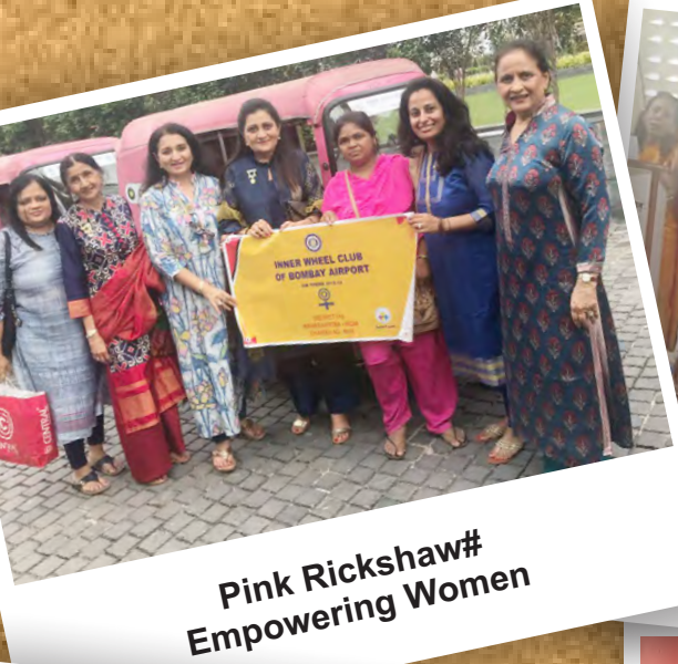
Pink Rickshaw# Empowering Women