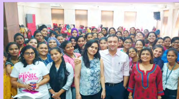
NSS week at Nanavati College