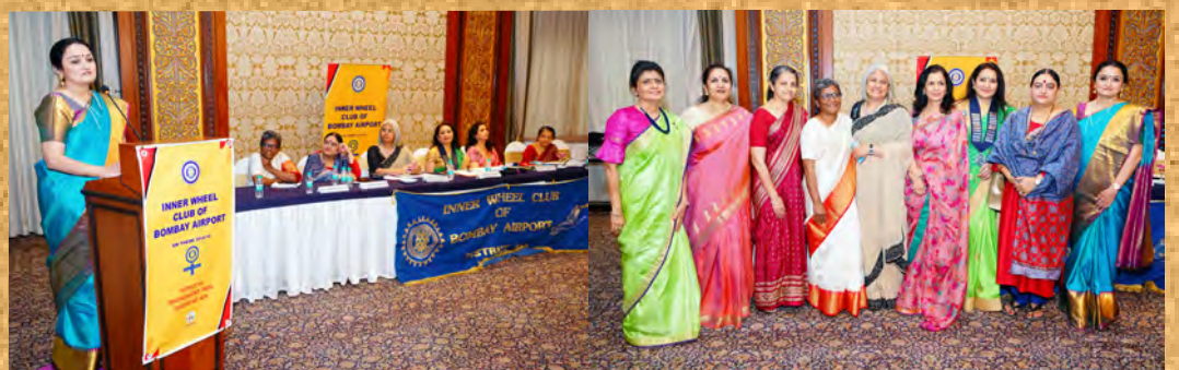
Woman Achiever Awards