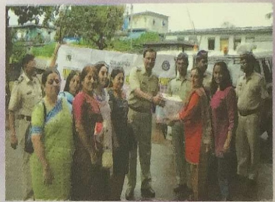
Distribution of Lemon Juice Bottles to Policeman on Anant Chaturdashi