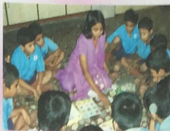
Children learning games at the Family play centre.