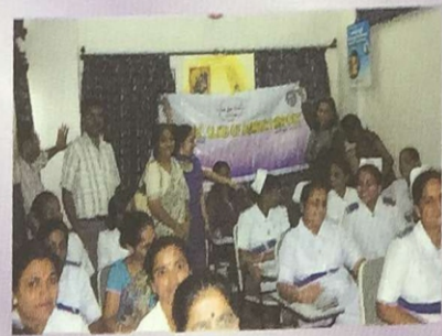
Promotion of Breast Feeding Workshop