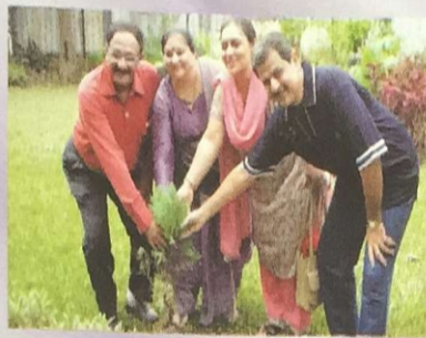
Rotary Shares IWCBA & RCBA