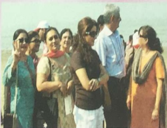
Star Tisca Chopra at Competition for special children at JUHU beach.