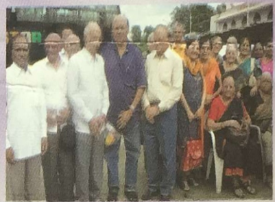
Senior Citizen's picnic at Titwala