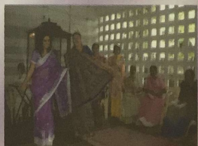
Ramp Walk Begins