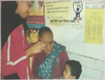
Pulse polio administration at Sambhaji health post.