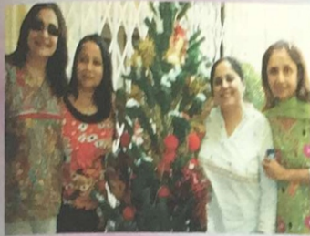
Regular meeting with Christmas celebrations.