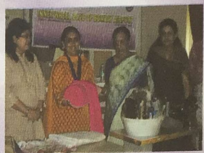
Donation of sewing machine, beauty parlour kit