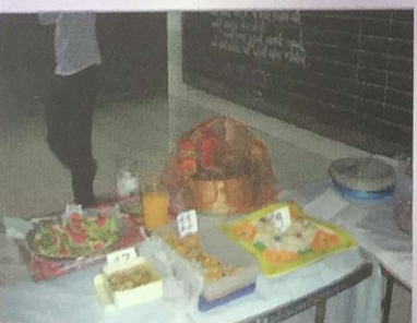
Sweets made by Senior Citizens