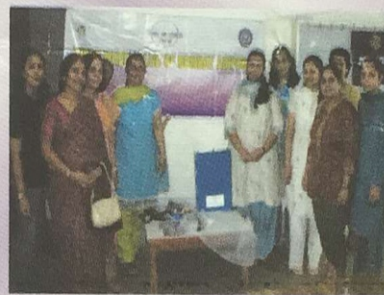
Donation of quatri machine, a joint project with RCBA