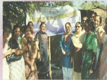
The complete toilet block.