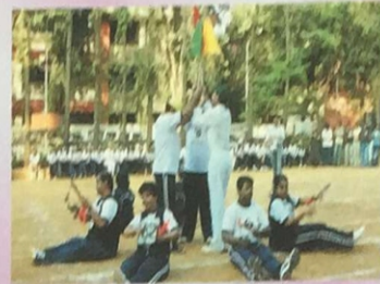
Special children performing lejin at the opening ceremony of Sports.