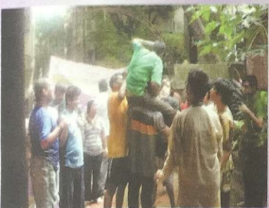
Dahi-handi at Udaan School