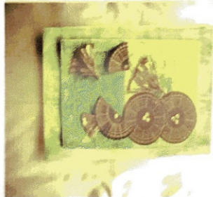
Invitation card for competition made by Pallavi Choksi