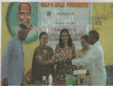
Donation of Utensils & night suits, at Ashramshala