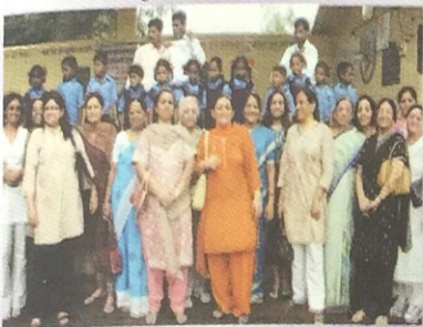
Sponsor a child education, at Wakdi