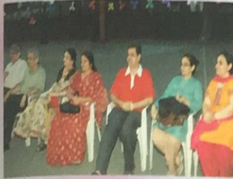
Rtrns join the Ann s at the sun fair