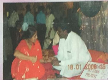
Members getting astrology reading at The Village Restaurant