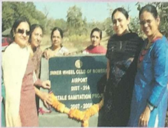
Inauguration of Sanitation Project at Katala Village, Maswan.