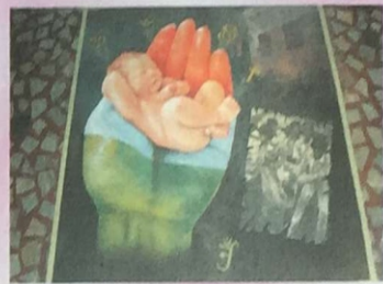
Prize winning rangoli on Communal Harmony.