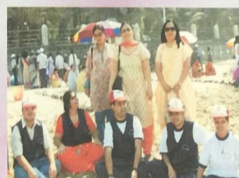
Members at the sand castle competition