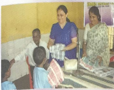
Distribution of Towels at Dongri Remand Home