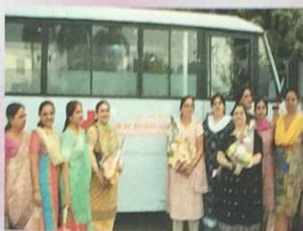
Donation of multipurpose utility ambulance to Nanavati hospital