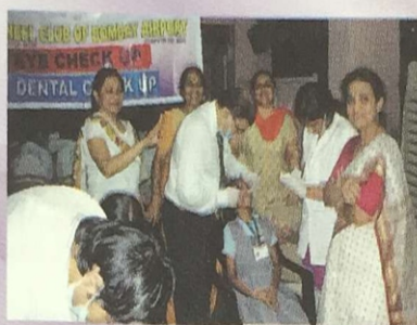
Dental Check up at Disha Karna Badhir