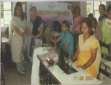
Sponsored tailoring course at YMCA