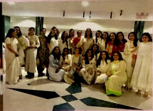
Organ Donation Seminar