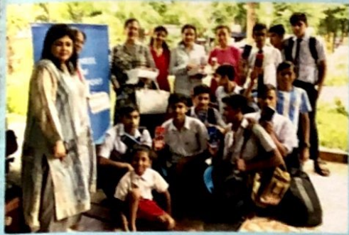
men in 3 schools.