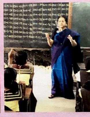
Orion School and Sane Guruji School