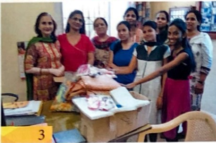
From left to right, 1 & 4. Donated khakhra vacuum machine @ Lonavia. 2. Donated Malkhamb at sane guruji school. 3. Donated quilling material ,50 pkts of paper n bags of flowers , 100 waxing strips. 5. 2 children where sponsored for national Judo competition