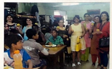
Mango distribution at Father Als boys home