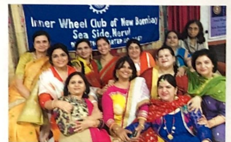
Celebrated Lohri with fellow CCs at Nerul