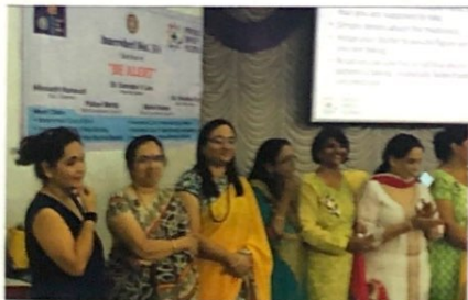
Be alert seminar at Chembur and Nerul for senior citizens