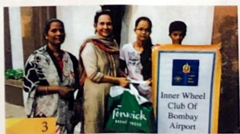
From top to bottom, 1. Donated Exhaust fans for boys of Dreamz home - Malavni 2. Celebrated Christmas at house of charity 3. Picnic organised for cancer patients of VCare at priyadarshini park