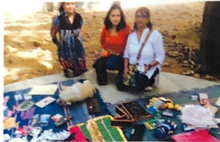
Flea Market at Gandhi Shikshan