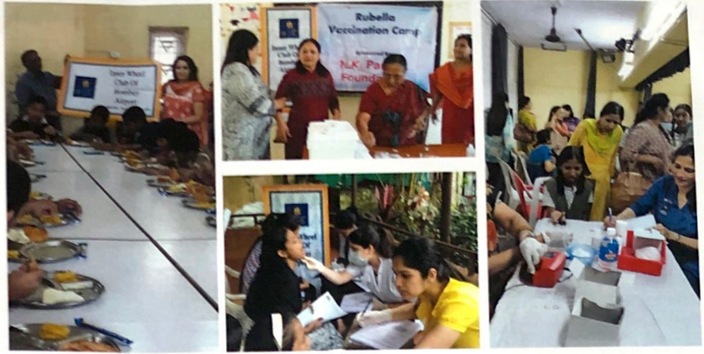
From left to right, Lunch arranged for YMCA kids Rubella vaccination and anaemia test at adivasi school Palghar Medical camp at angel express Medical camp at Sane Guruji