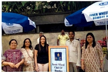
From left to right, Donated cheque for survivors of police inspector who lost his life on duty. Donated umbrellas to vendors