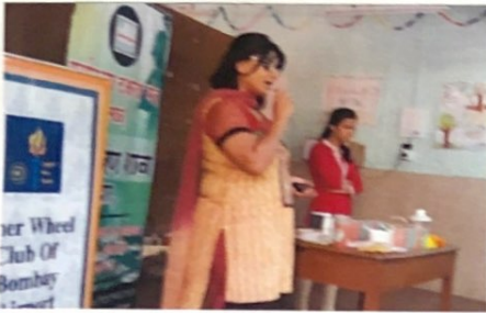
Workshop held in 2 BMC schools on making & using organic colours for holi .