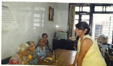
Mango distribution at Old age home Bandra