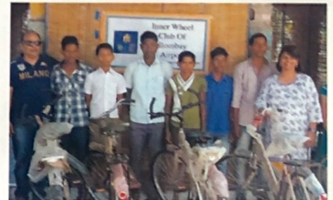
13 cycles donated at Savroli village for students walking 12 Kms daily