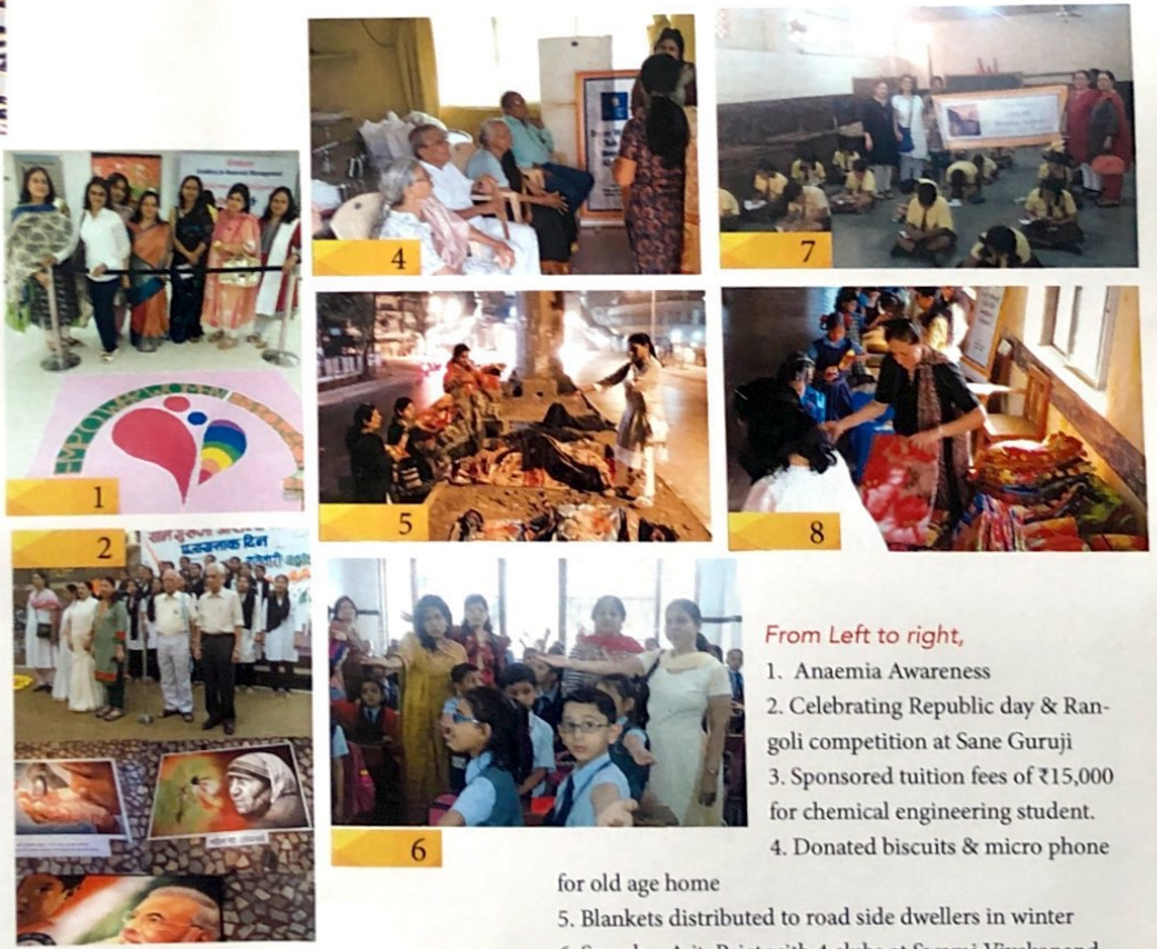
From Left to right, 1. Anaemia Awareness 2. Celebrating Republic day & Rangoli competition at Sane Guruji 3. Sponsored tuition fees of ₹15,000 for chemical engineering student. 4. Donated biscuits & micro phone