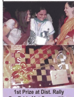
1st Prize at Dist. Rally For Table Mat Competition