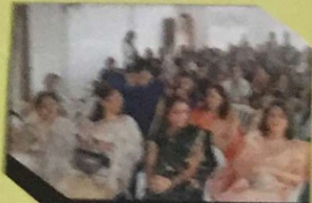
Family Planning Talk at Nanavati College