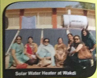
Solar Water Heater at Wakdi