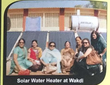
Solar Water Heater at Wakdi