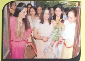
Opening of Maitreyi Exhibition