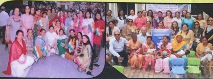
Amritsar- Wagha Border & At Institute for Childhood Disability