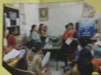
Cooking Workshop for Underprivileged Women