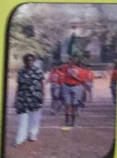
Disaba karna Sadhir Sports day