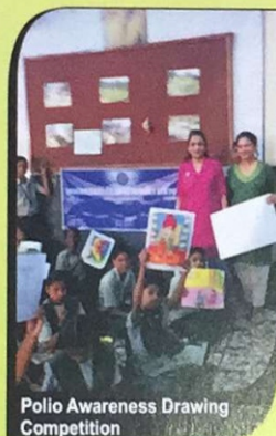
Polio Awareness Drawing Competition