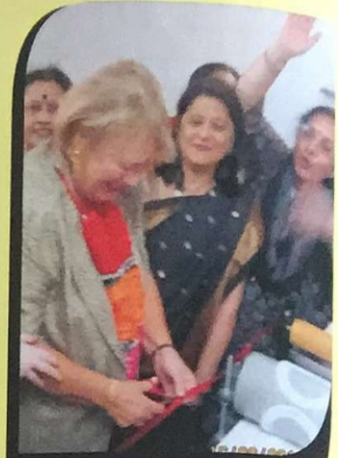
Roti & Dough making machine At Blind Girls Home-Ahmedabad