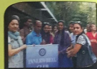
Donation of Food Packet at Anukampa Blind Home