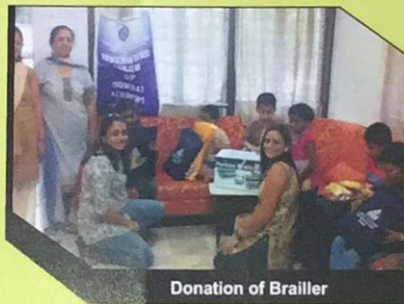
Donation of Brailier