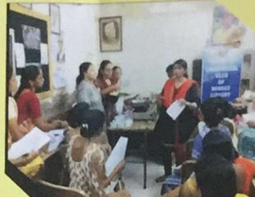
Cooking Workshop for Underprivileged Women