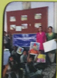
Polio Awareness Drawing Competition