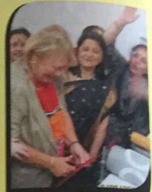
Roti & Dough making machine At Blind Girls Home-Ahmedabad