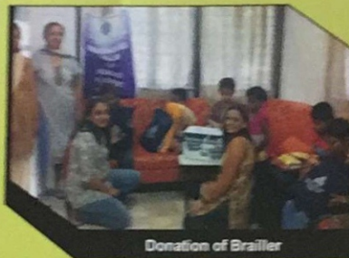
Donation of Brailier