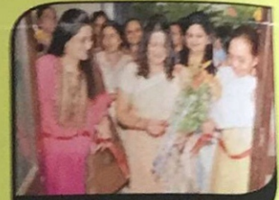
Opening of Maitreyi Exhibition