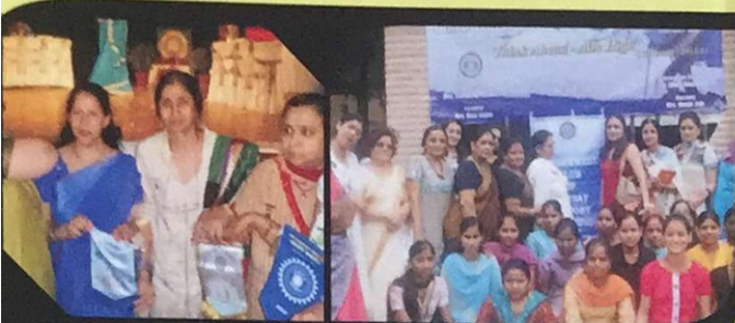
ISO Meet at Chandigarh- Flag Exchanged & Vist to Nursing School