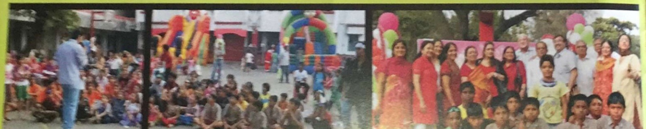
Christmas Party at YMCA

"Woman who seek to be equal with man lack ambition" ..... Timothy Leary.