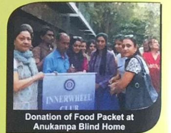
Donation of Food Packet at Anukampa Blind Home