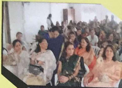
Family Planning Talk at Nanavati College